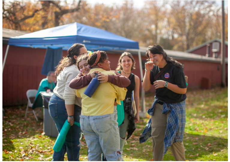
Friends reunited at the Camp Reunion during Healthy HeARTS Fest in November 2022.

Join other camp alumni at this public event on Earth Day, April 22 from 1pm-5pm to learn and explore in the garden, and prepare for Summer 2023! Plan to stay later for a special alumni only campfire.