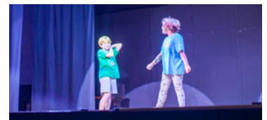
Followed by a special "Friday" Night Concert with some awesome performances.